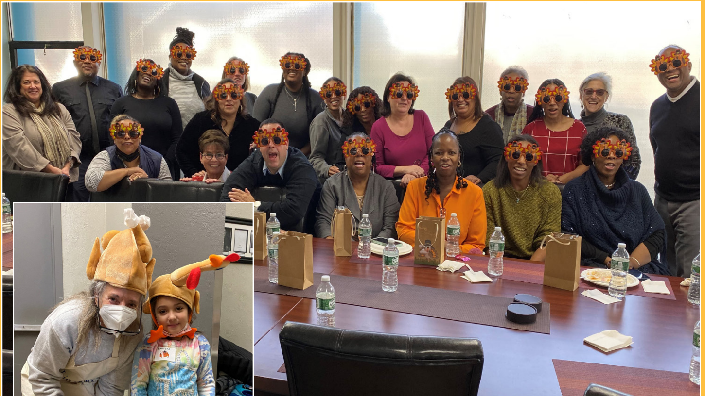
Above: Showing appreciation to our staff on Thanksgiving. Left: Training a new generation to give back to our community!