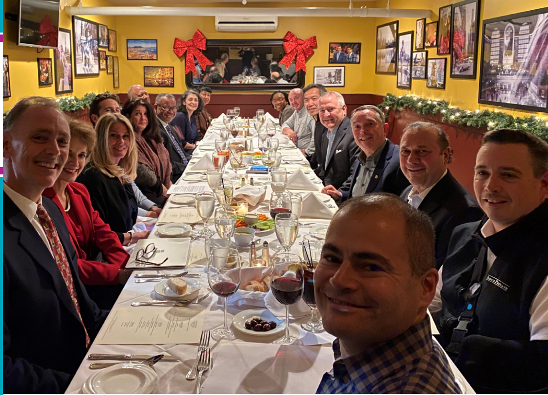
Lifting Up Westchester Board and Senior Staff Celebrating Completing the Strategic Plan